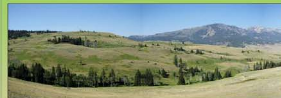
Typical L. dalmatica habitat in the Northern Range of Yellowstone National Park.