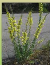
Adult L. dalmatica in flower.

Numerous studies have shown that NIS richness decreases with increased elevation throughout the world 2 . However, the reasons for this trend are unclear. This may be due to fewer opportunities to establish at higher elevations (lower propagule supply 6 , less time since introduction 4 , less disturbance 7 , or simply less land area to colonize 8 ), or to the inability of NIS to establish due to more harsh conditions at higher elevations. To better understand this phenomenon, the responses of individual NIS must be measured along elevation gradients to determine if their current ranges are dictated by opportunity, ability, or a combination of both. This information will be of critical importance to land managers in these areas in that it will provide an improved understanding of how to proceed with management of NIS within their current ranges, and if/how NIS ranges may shift as a result of future climate change.