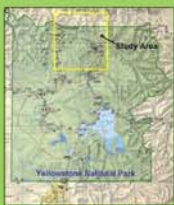
Approximate location of study area.