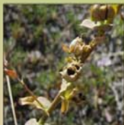
Close up of mature seed capsule on adult L. dalmatica plant.