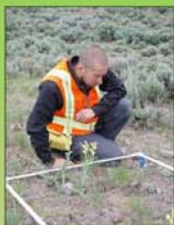
Collecting data from a L. dalmatica plot in the field.